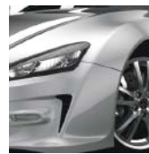
Automotive - Body